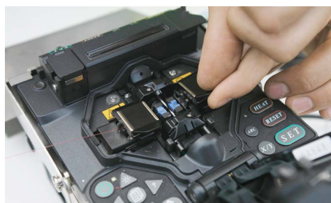
Fibre optic splicing