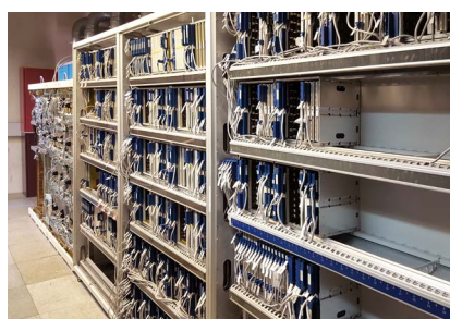
Test facility for fixed-line technology